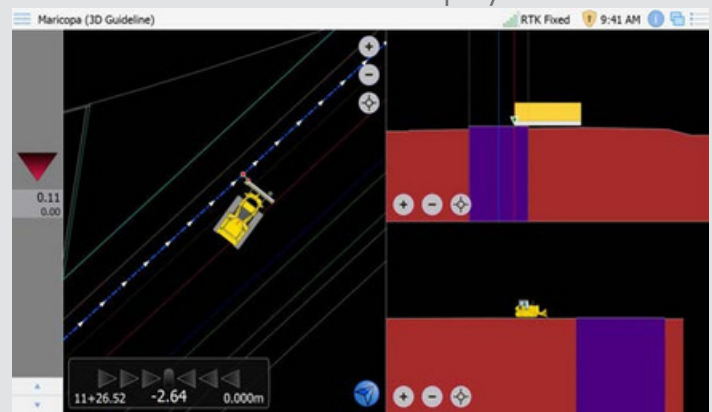
Navigation to a Point