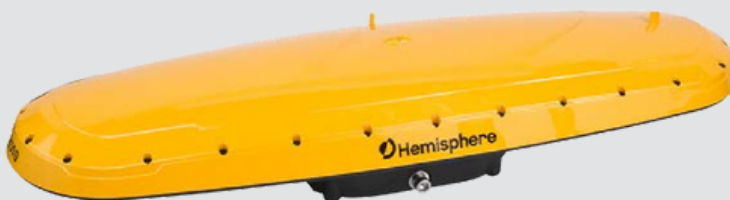
VR500 GNSS RTK Smart Antenna

Grademetrix is designed with support for the VR1000 and VR500 GNSS RTK heading receivers. Both receivers, with their integrated UHF radio, require a single cable connection to the IronTwo display. Multiple decades of experience merging GNSS technology with precision applications provides a simplified installation and calibration procedure.