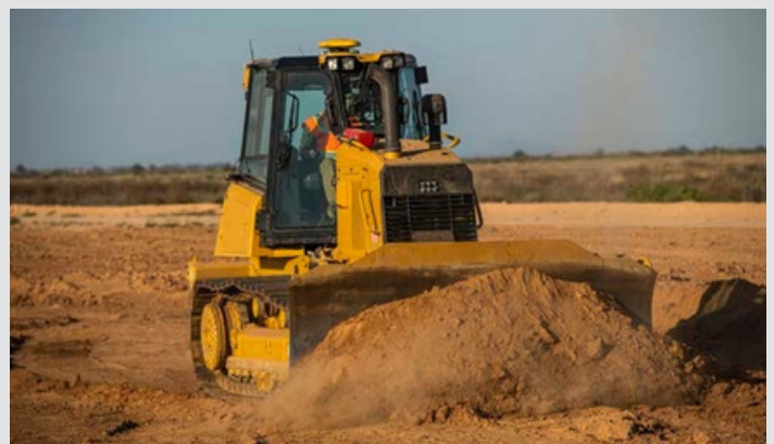
SITE PREPARATION – COARSE GRADING