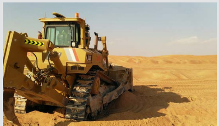
MINING – PASS-2-PASS GUIDANCE