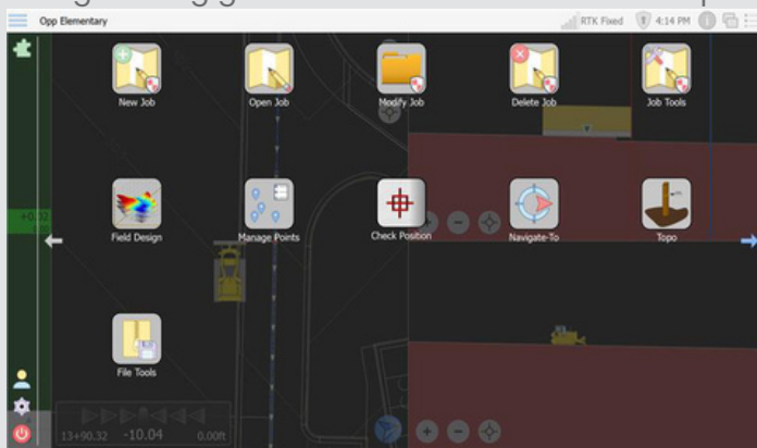
Supports large DTM's

Use of the GradeMetrix® GNSS based system allows operators to match a slope or extend a pad, ramp, or ditch along existing ground features. Intuitive Menu Design create new ramps and basic roads in the field. Multiple Views