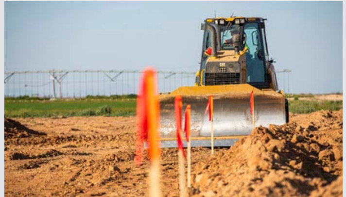
ROAD CONSTRUCTION – MATERIAL LAYERING